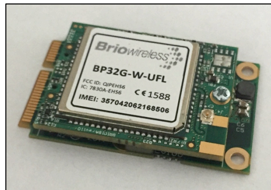
BitPipe™ on Mini-PCI Express Adapter (BitPipe™ Modem sold separately)

Ideally suited for hardware and software engineers, integrators, students and hobbyists.